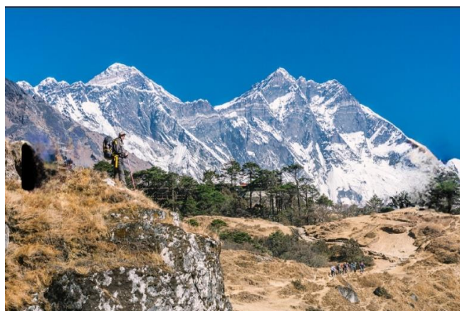
Everest View Hotel with Mount Everest above on the left